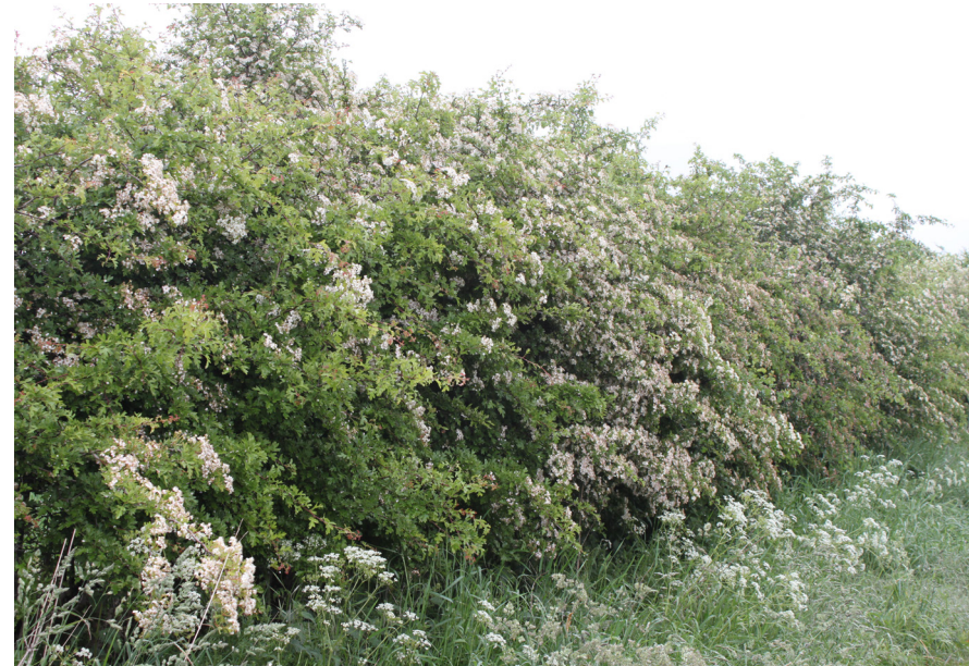
FIGURE 3: NATIVE HEDGEROW